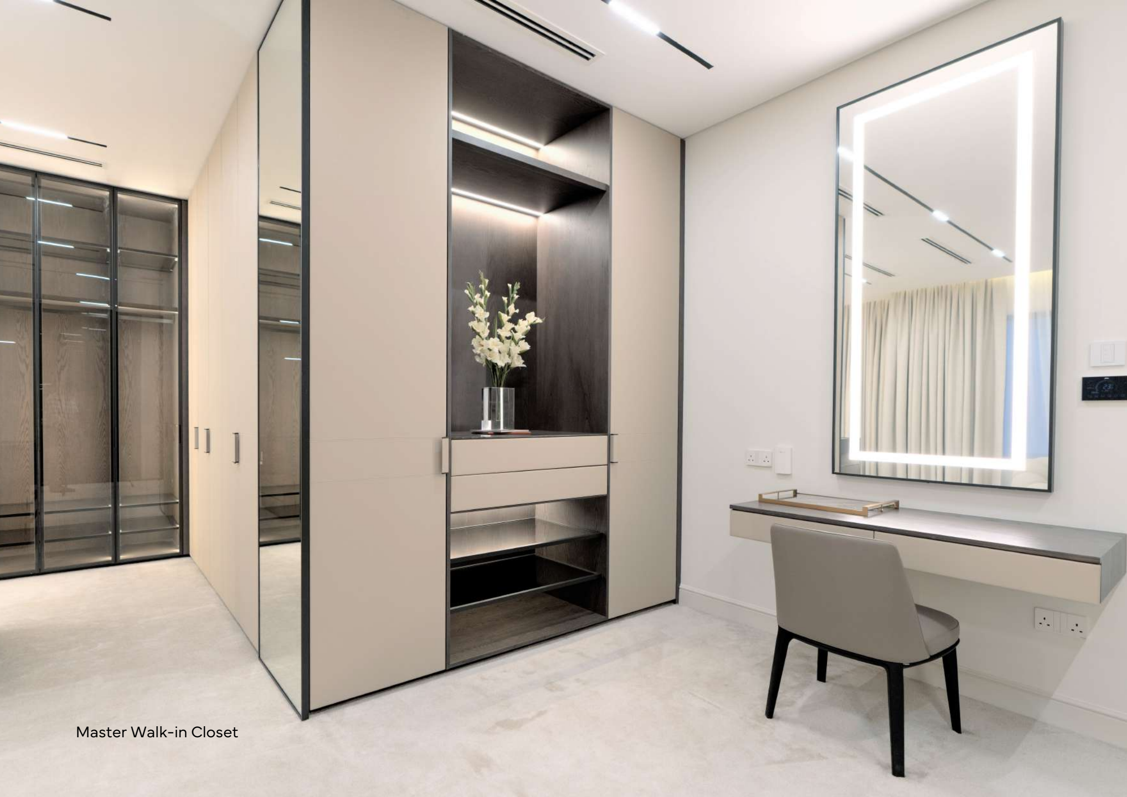
Master Walk-in Closet