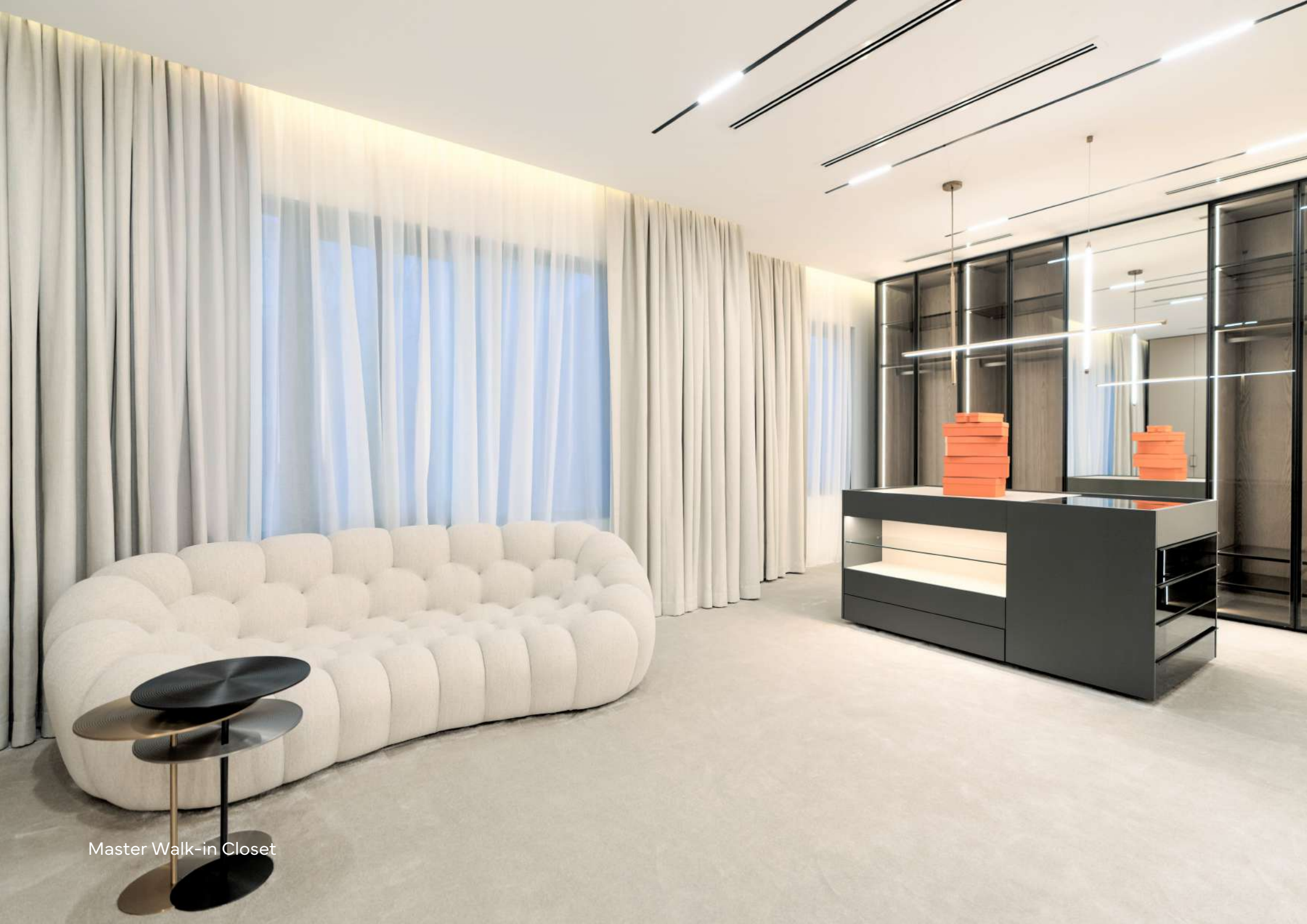
Master Walk-in Closet