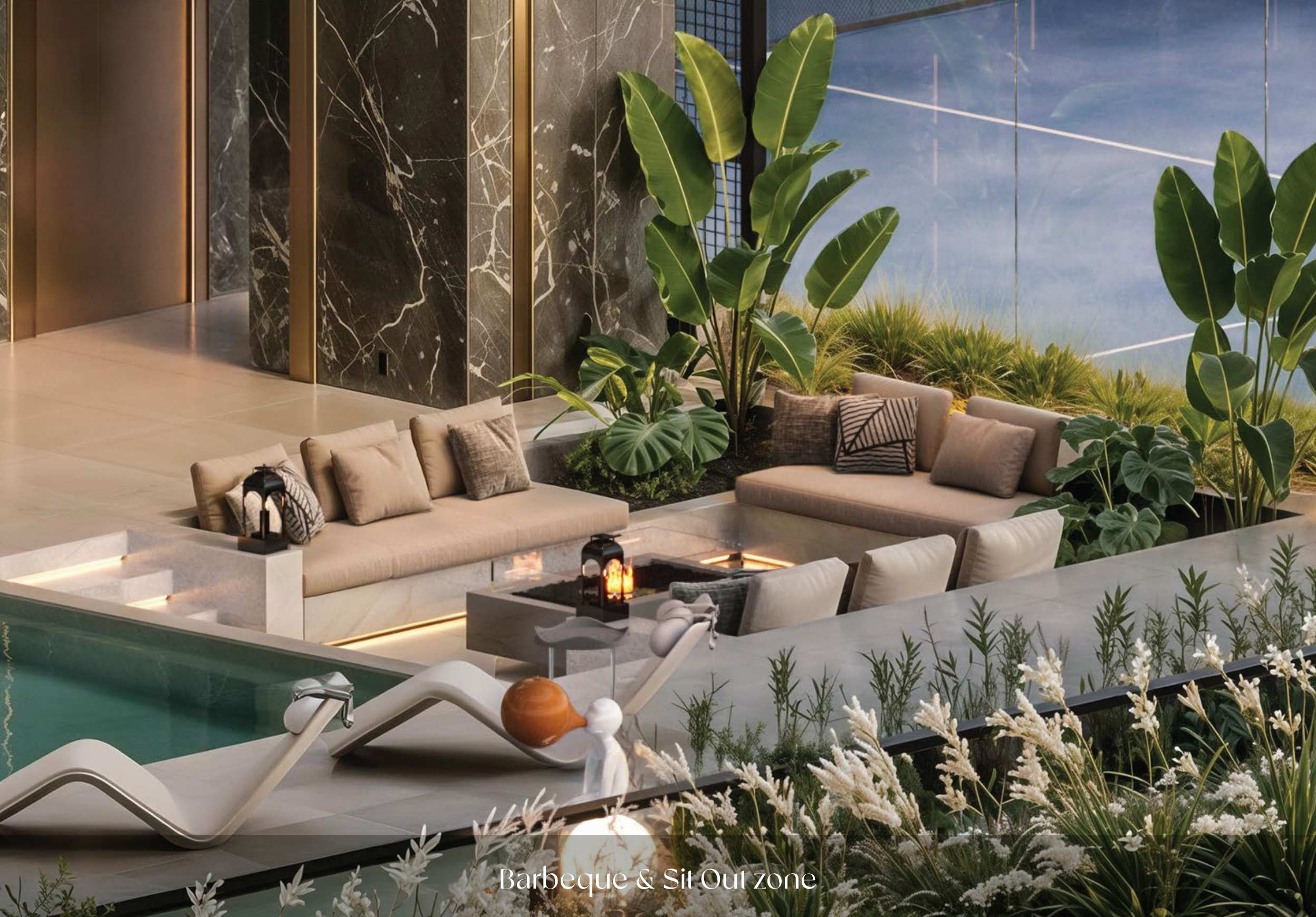
Barbeque & Sit Out zone