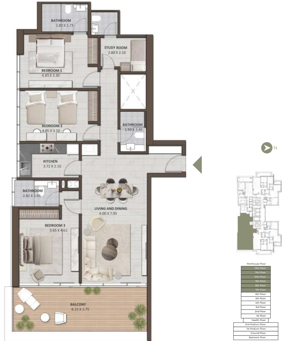
FURJAN COMMUNITY FACING

PASSAGE LIVING & DINING KITCHEN 3 BEDROOMS 4 BATHROOMS BALCONY STUDY ROOM