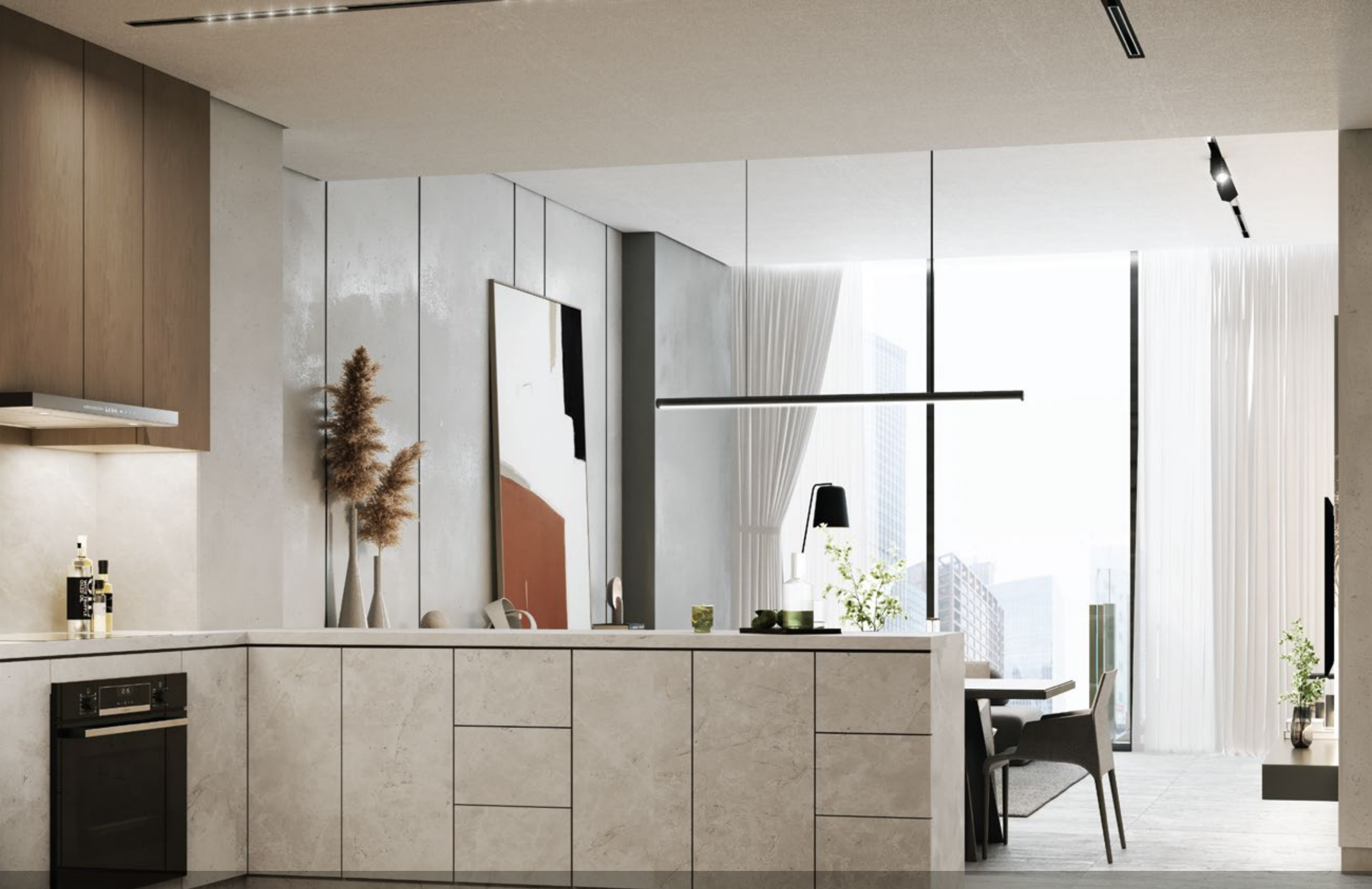
Kitchen with Branded Appliances