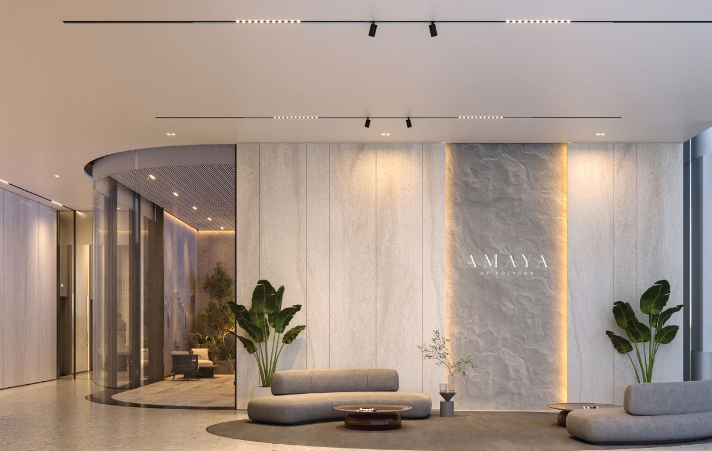
Double Height Opulent Atrium