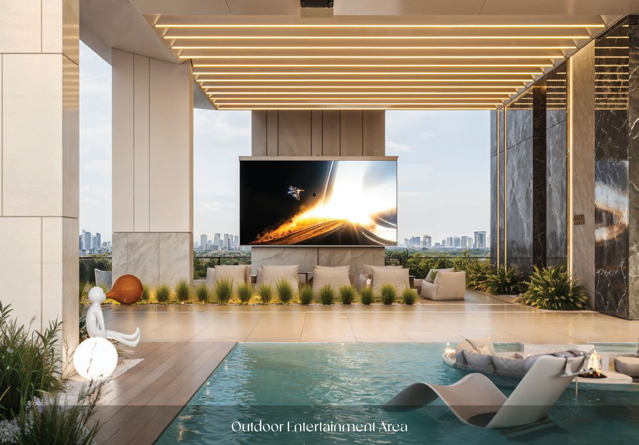
Outdoor Entertainment Area