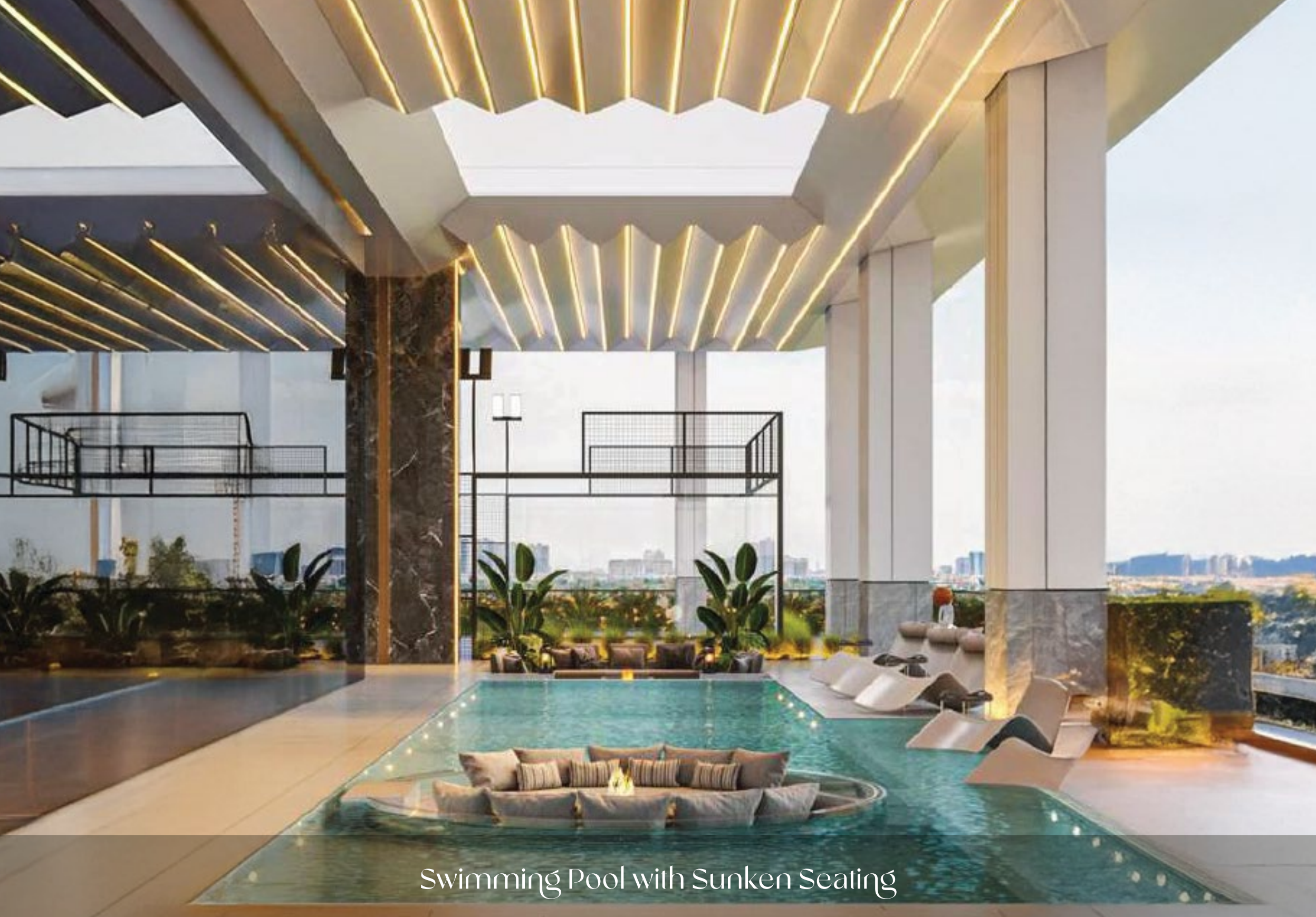
Swimming Pool with Sunken Seating